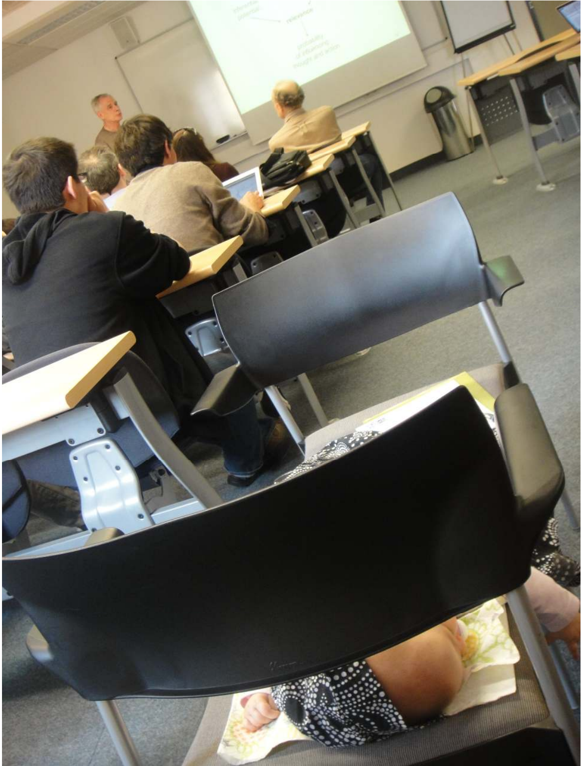
Budapest, Hungary (March 2014, O. at 4 months)