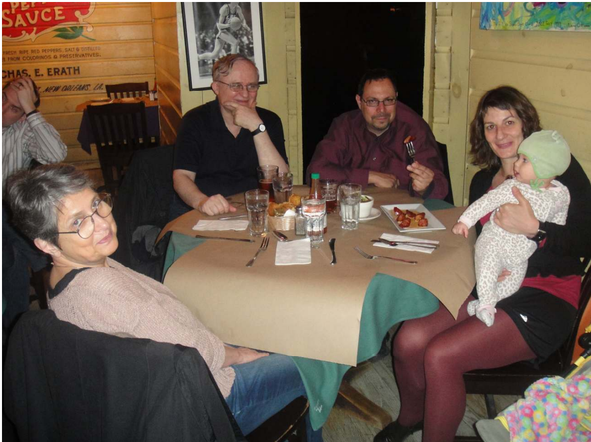
New York City, NY, U.S. (April 2014, O. at 5 months), with our first NYC hosts