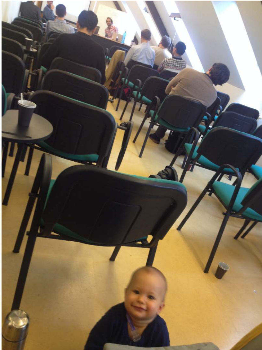
Bratislava, Slovakia (October 2014, O. at 11 months)