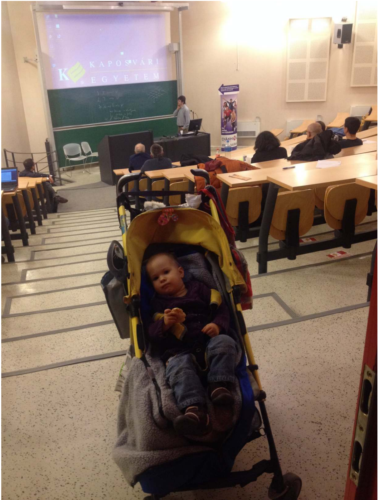
Kaposvár, Hungary (January 2016, O. at 14 months)