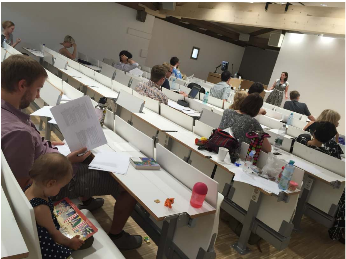
Salzburg, Austria (July 2015, O. at 20 months)