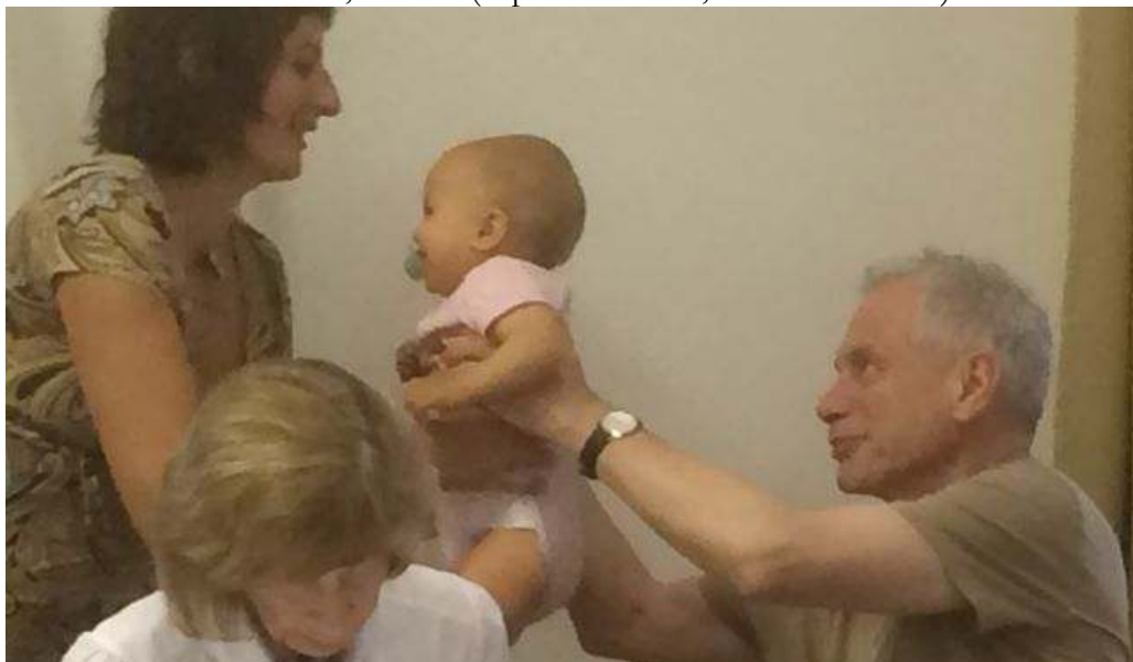
Dubrovnik, Croatia (September 2014, O. at 10 months)