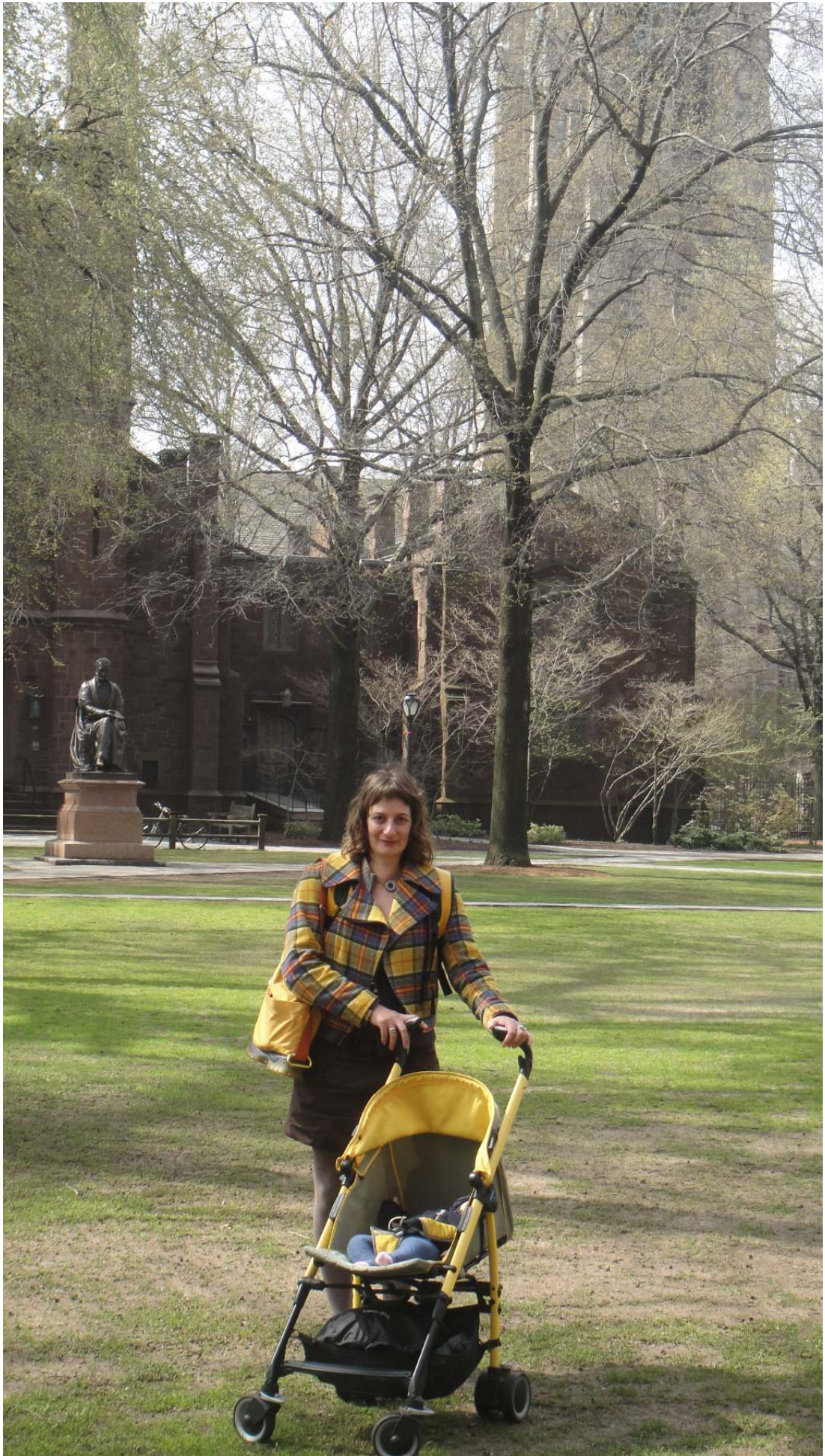
New Haven, CT, U.S. (May 2014, O. at 6 months)