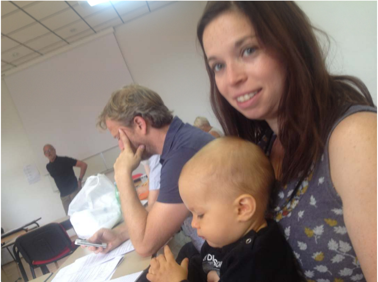
Dubrovnik, Croatia (September 2014, O. at 10 months)