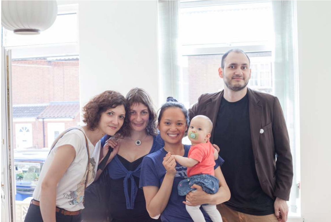
Norwich, England (June 2014, O. at 7 months), with our hosts