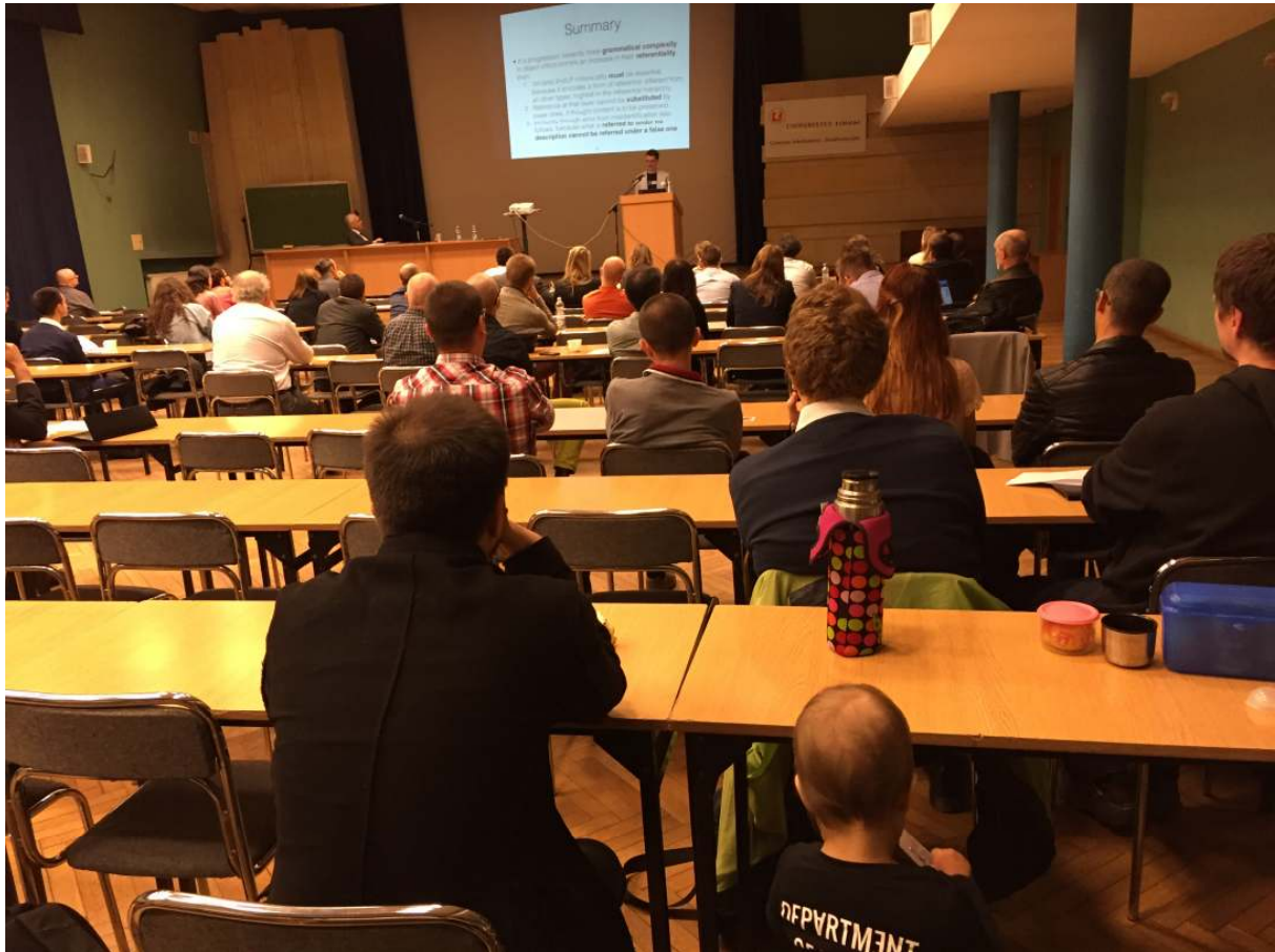
Łódź, Poland (May, 2015, O. at 18 months)