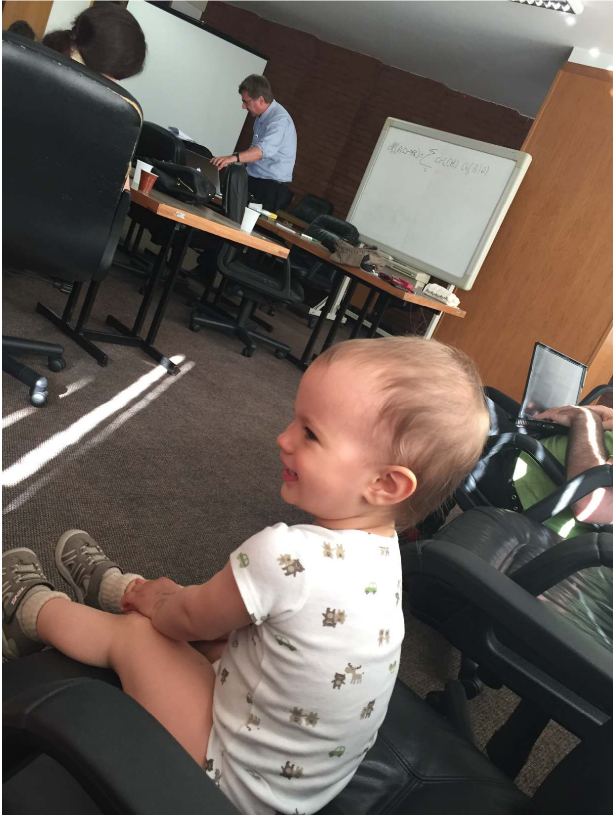
Belgrade, Serbia (June 2015, O. at 19 months)