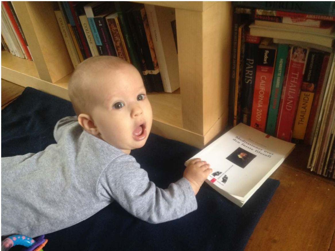
Norwich, England (June 2014, O. at 7 months), with a Danish edition of the Meditations .