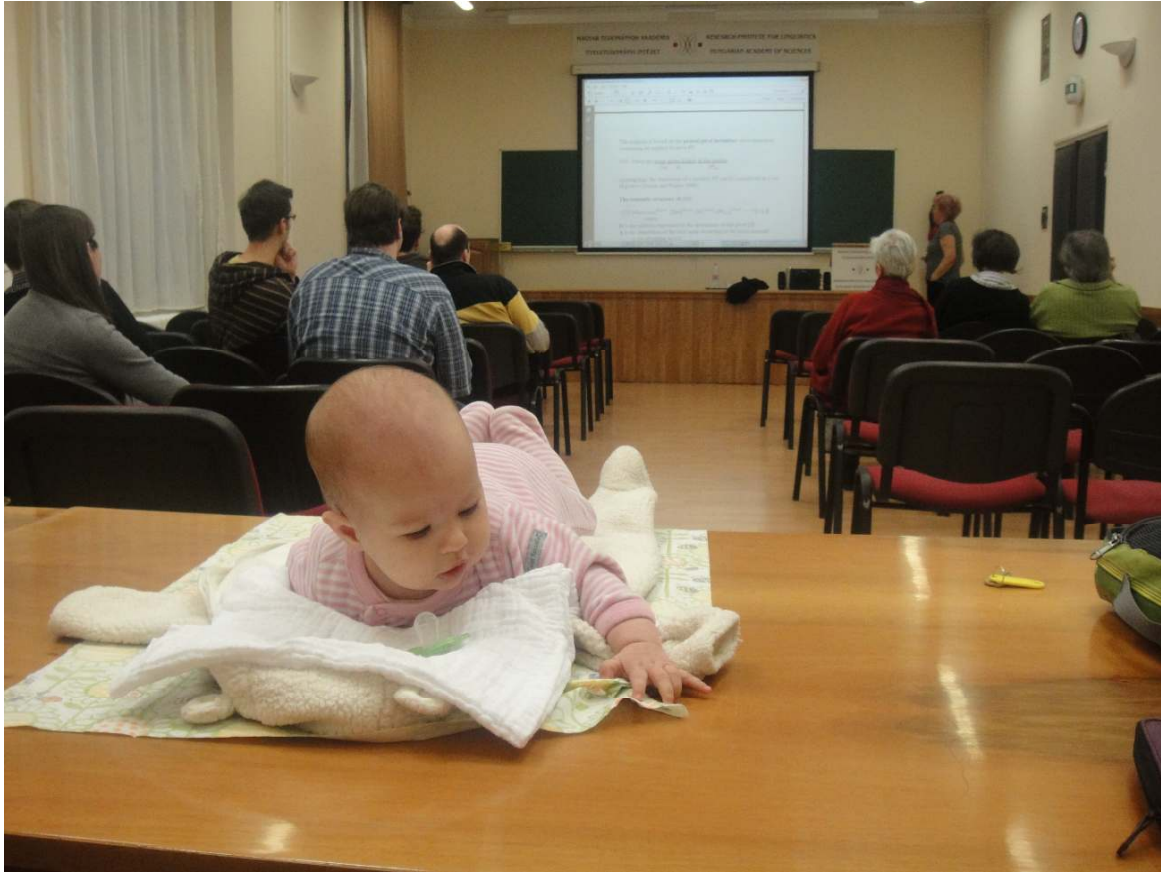
Budapest, Hungary (February 2014, O. at 3 months)