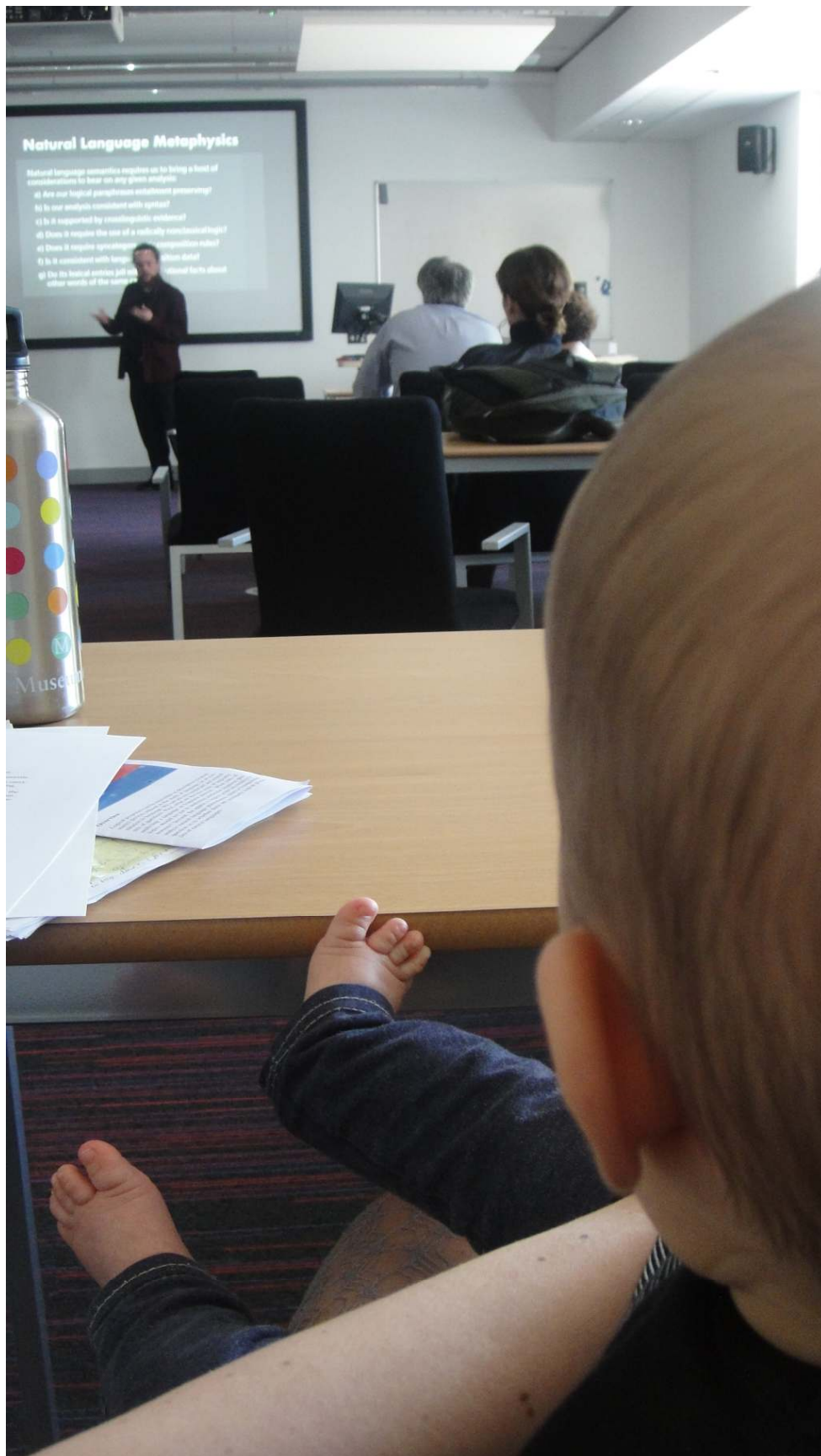
Norwich, England (June 2014, O. at 7 months)