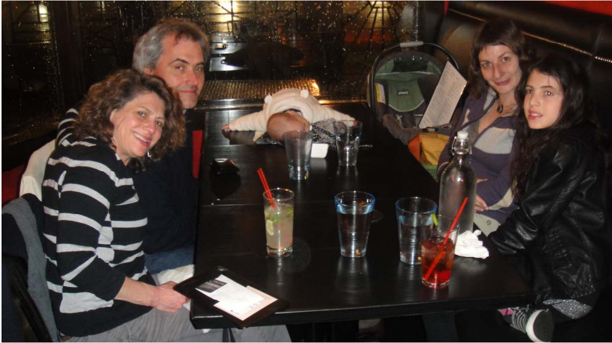
New Haven, CT, U.S. (May 2014, O. at 6 months), with our hosts