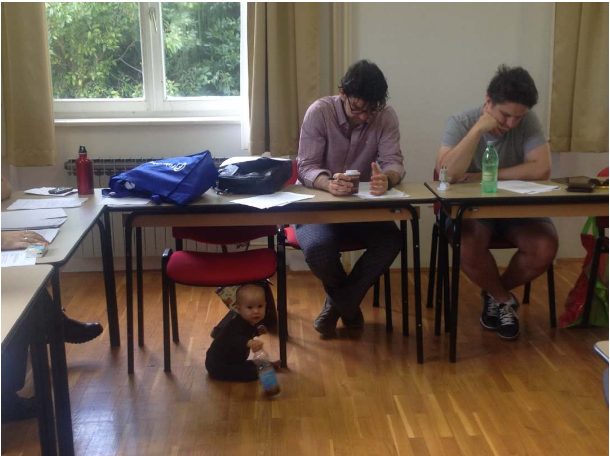
Dubrovnik, Croatia (September 2014, O. at 10 months)