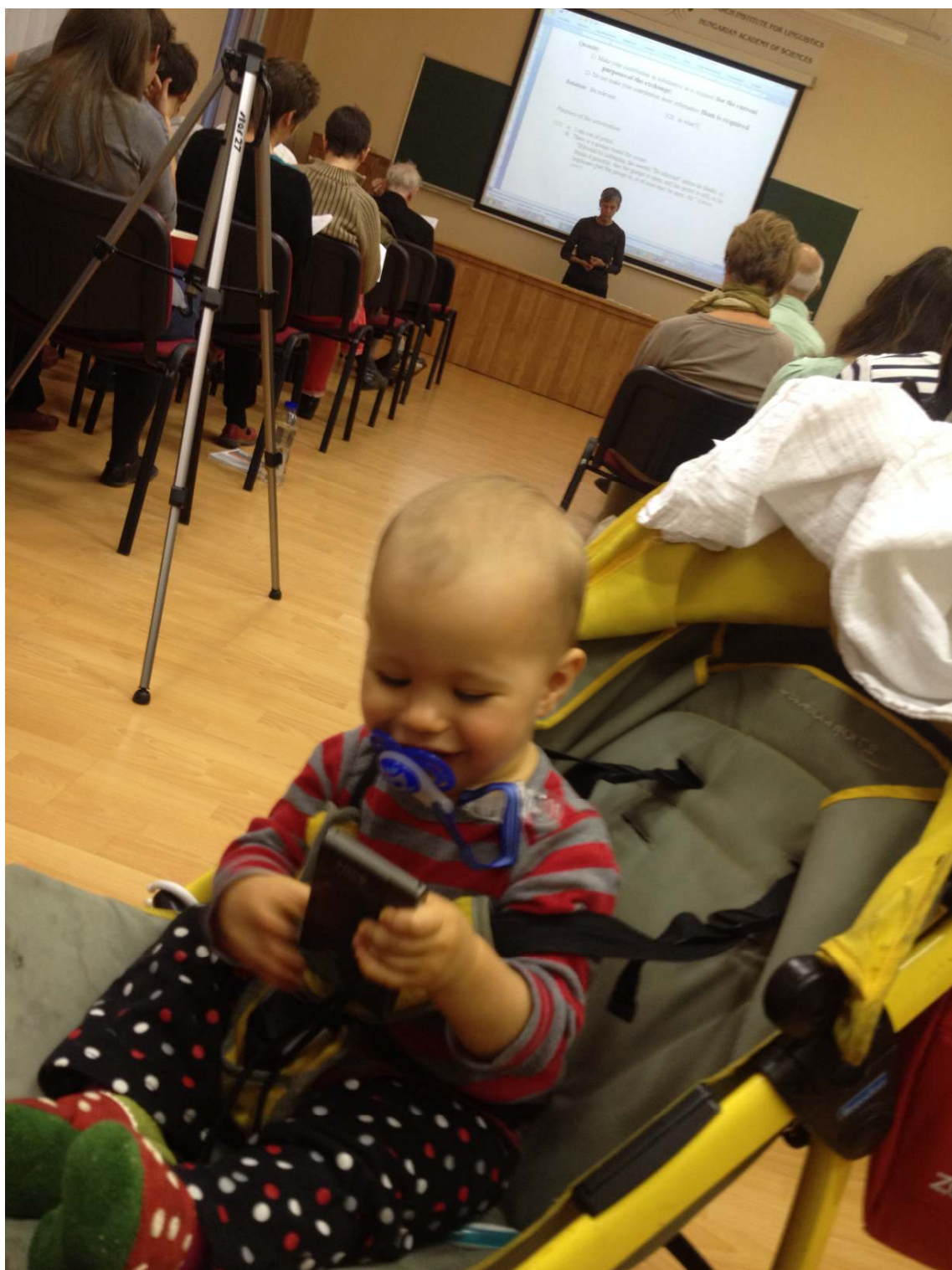
Budapest, Hungary (November 2014, O. at 12 months)