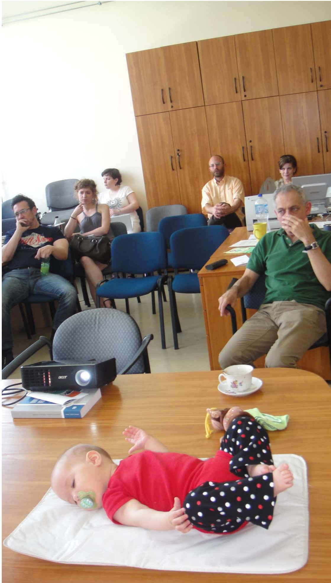
Budapest, Hungary (May 2014, O. at 6 months)