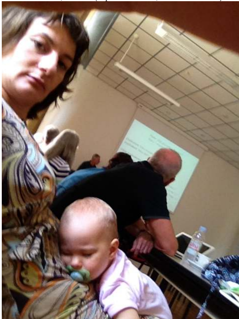
Dubrovnik, Croatia (September 2014, O. at 10 months)