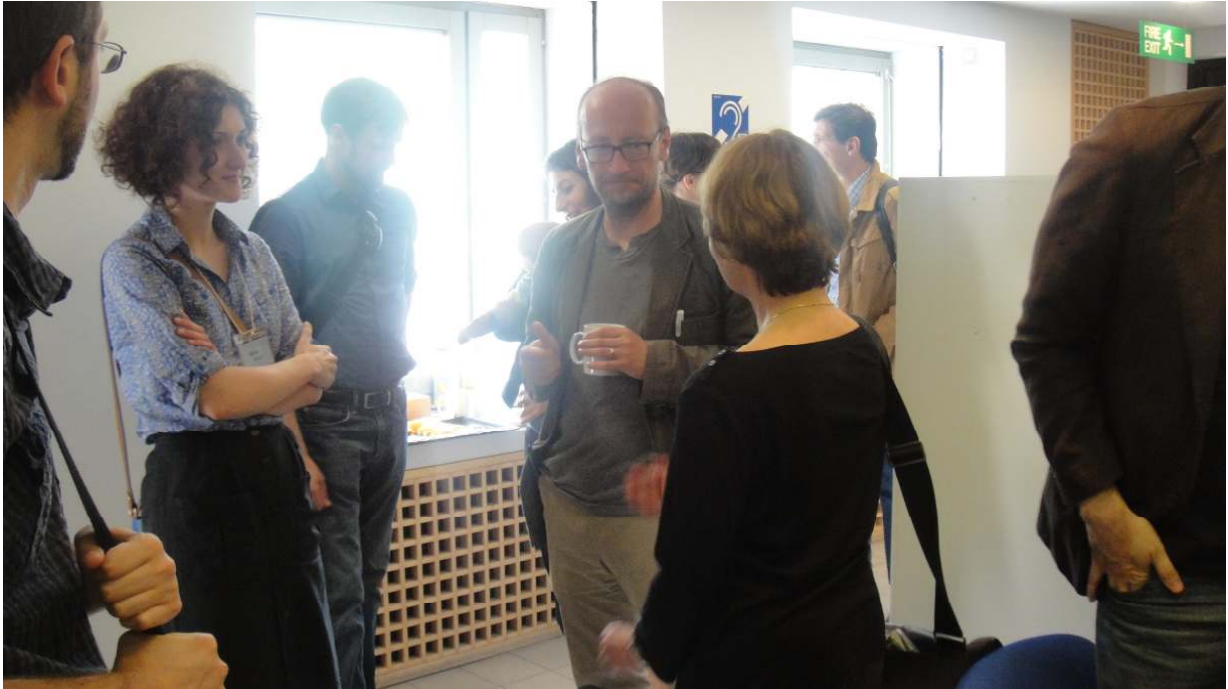
Norwich, England (June 2014, O. at 7 months)