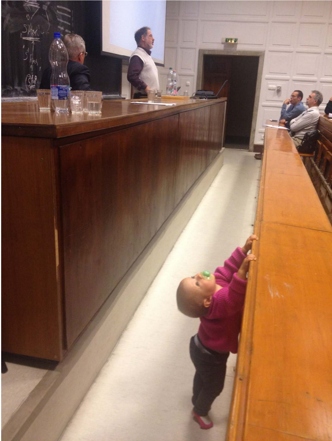
Budapest, Hungary (September 2014, O. at 10 months)