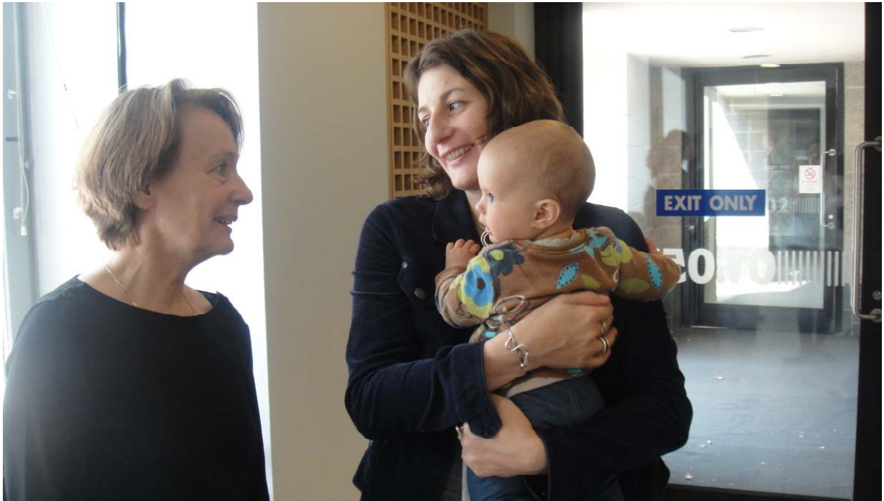
Norwich, England (June 2014, O. at 7 months)