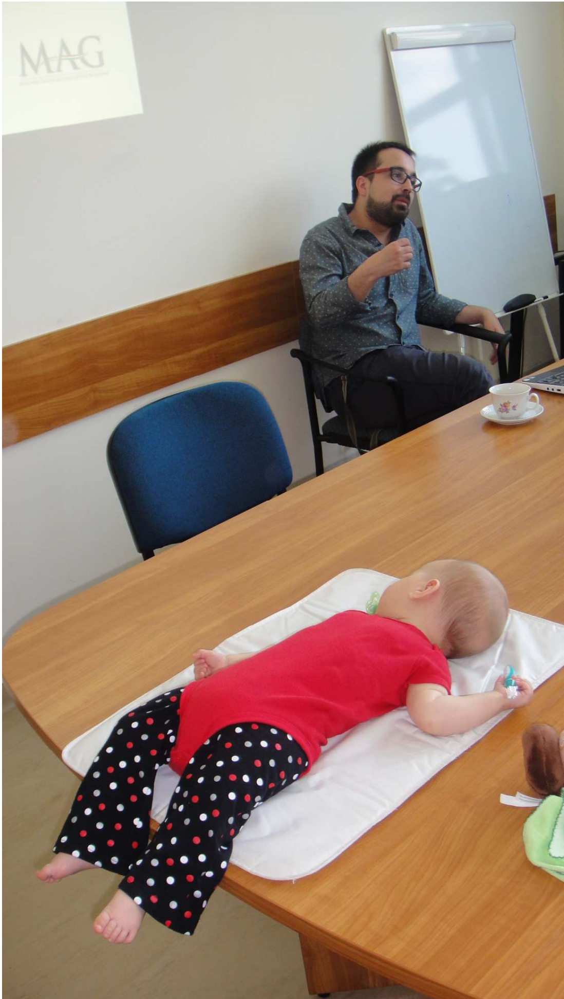
Budapest, Hungary (May 2014, O. at 6 months)