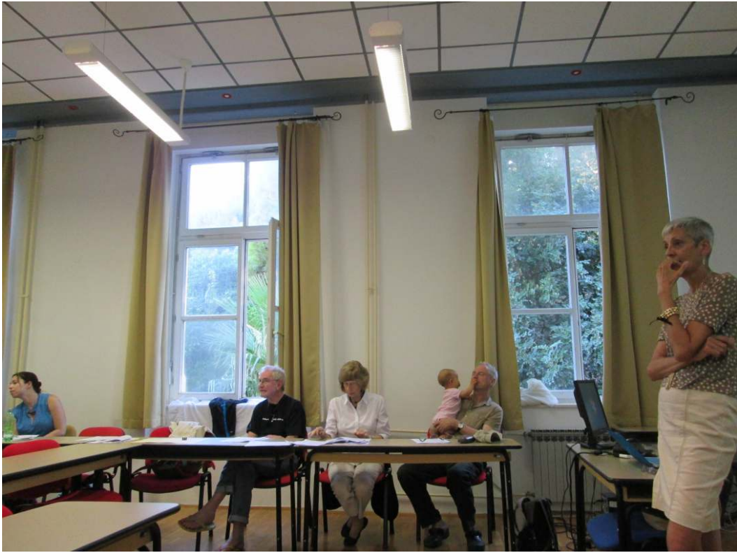
Dubrovnik, Croatia (September 2014, O. at 10 months)