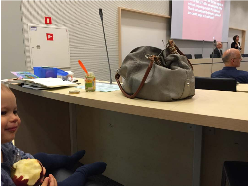
Łódź, Poland (May, 2015, O. at 18 months)