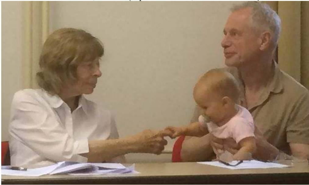
Dubrovnik, Croatia (September 2014, O. at 10 months)