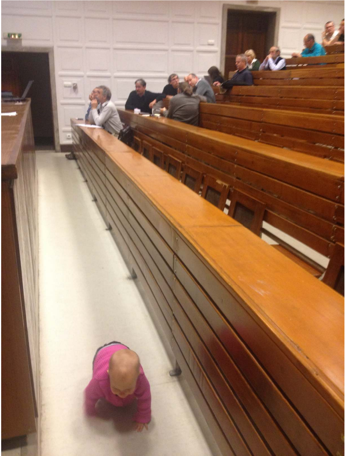
Budapest, Hungary (September 2014, O. at 10 months)