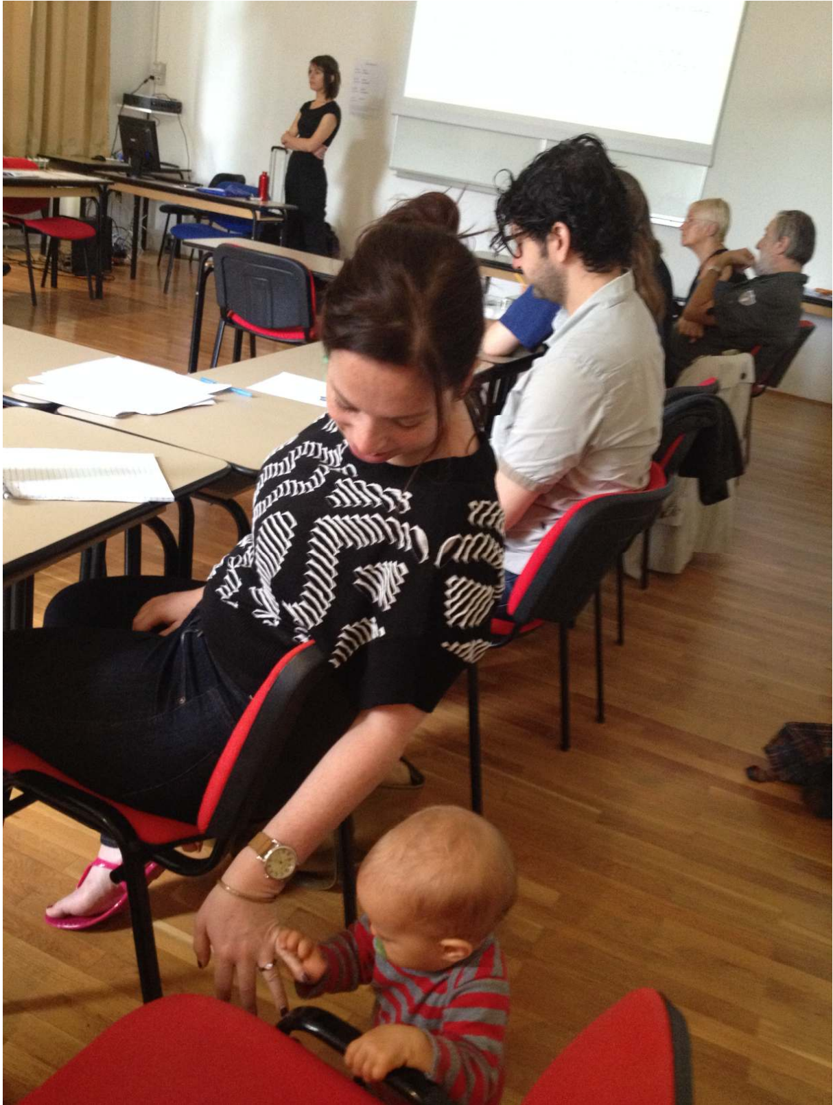
Dubrovnik, Croatia (September 2014, O. at 10 months)