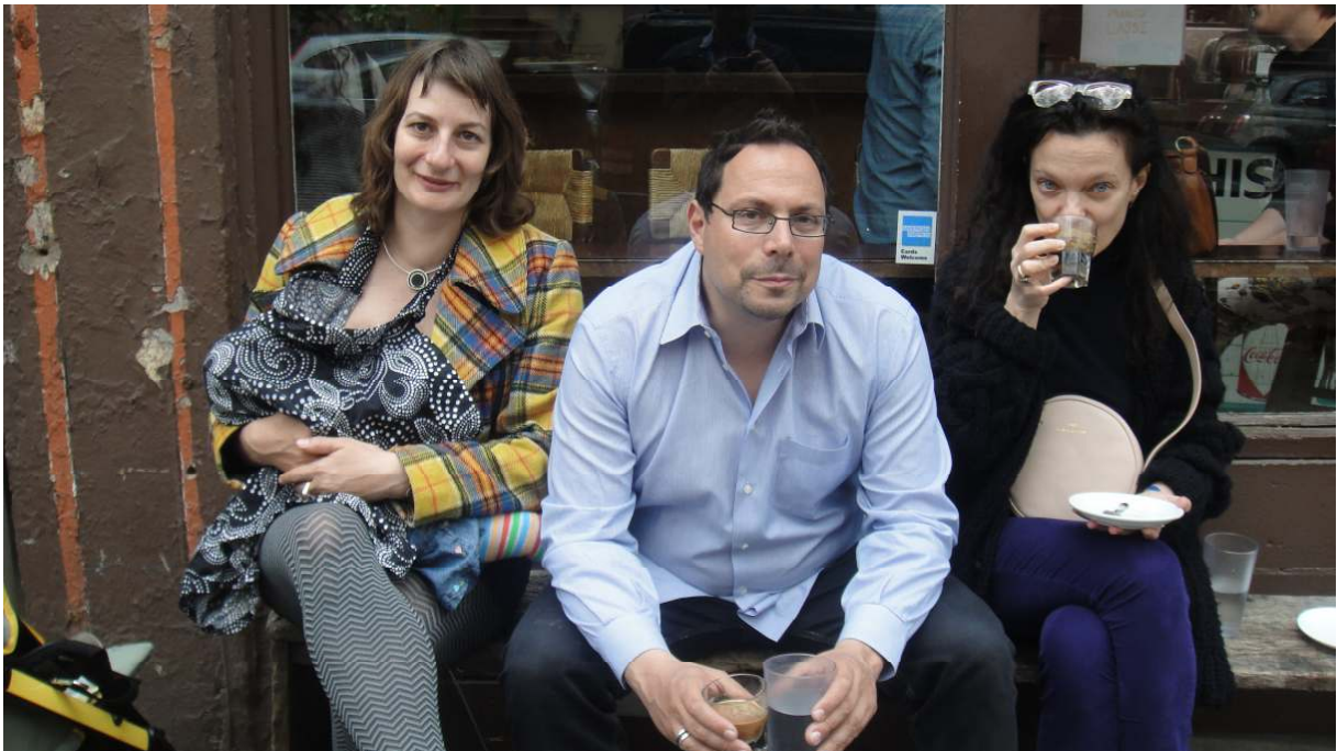
New York City, NY, U.S. (May 2014, O. at 6 months) with our last NYC host