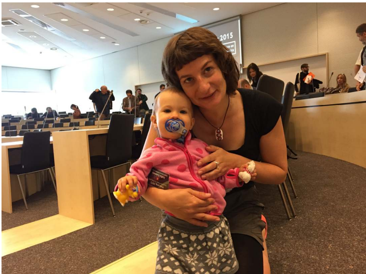
Łódź, Poland (May, 2015, O. at 18 months)