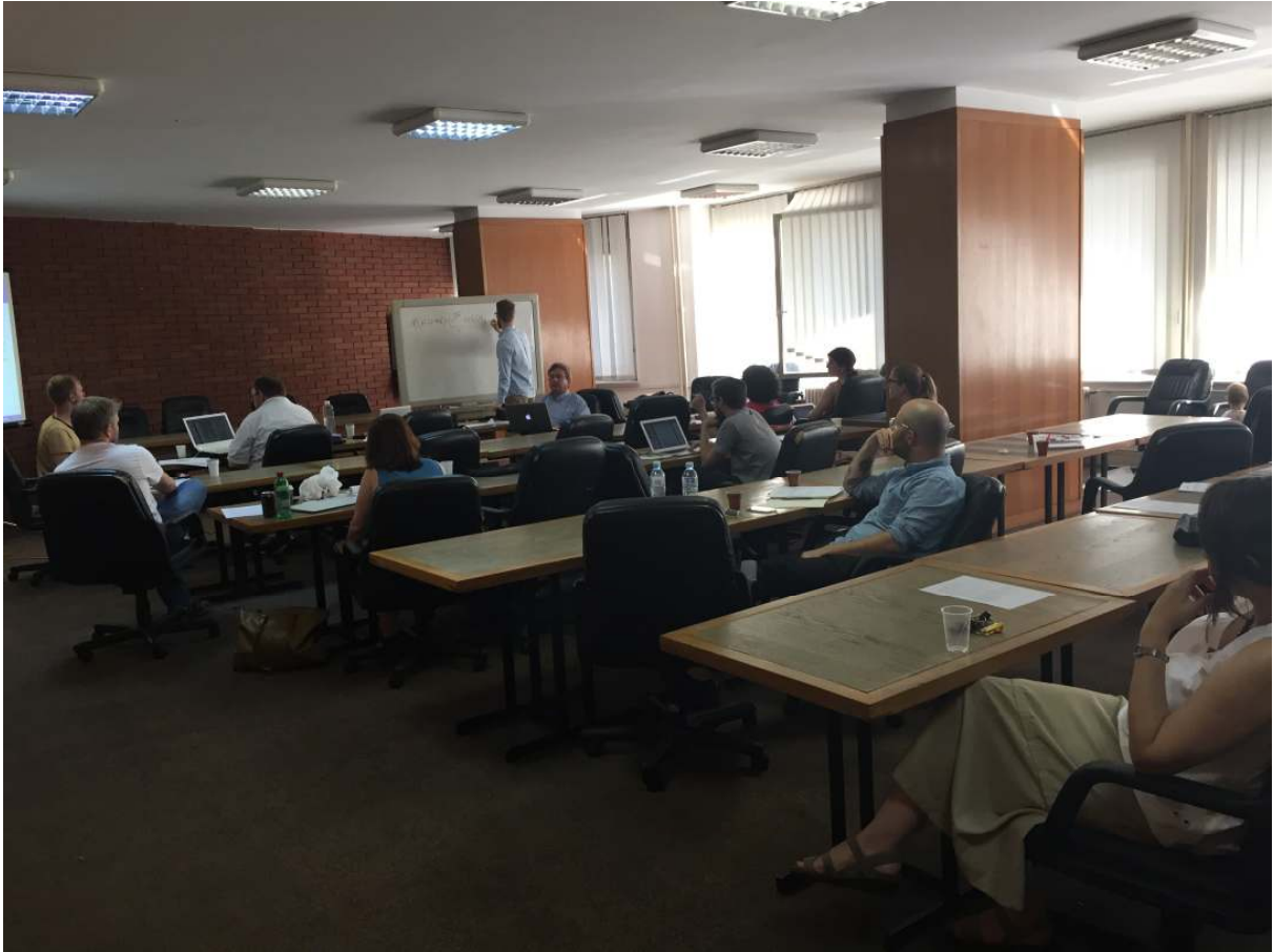
Belgrade, Serbia (June 2015, O. at 19 months)