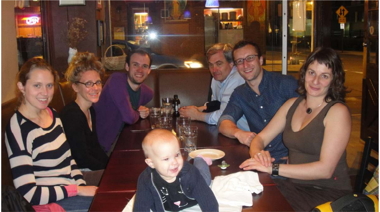
New Haven, CT, U.S. (May 2014, O. at 6 months)