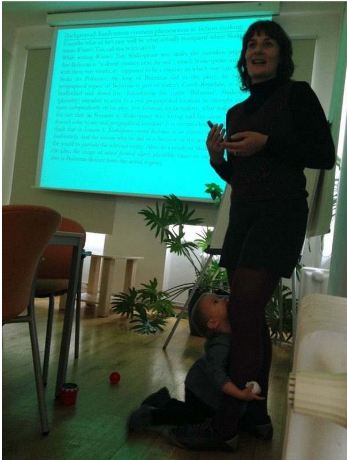
Prague, Czech Republic (September 2015, O. at 22 months)