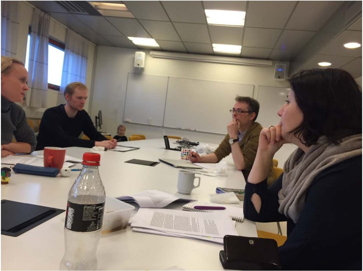
Oslo, Norway (November 2015, O. at 24 months)