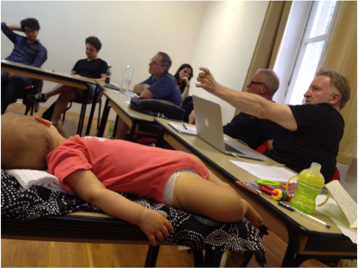
Dubrovnik, Croatia (September 2014, O. at 10 months)