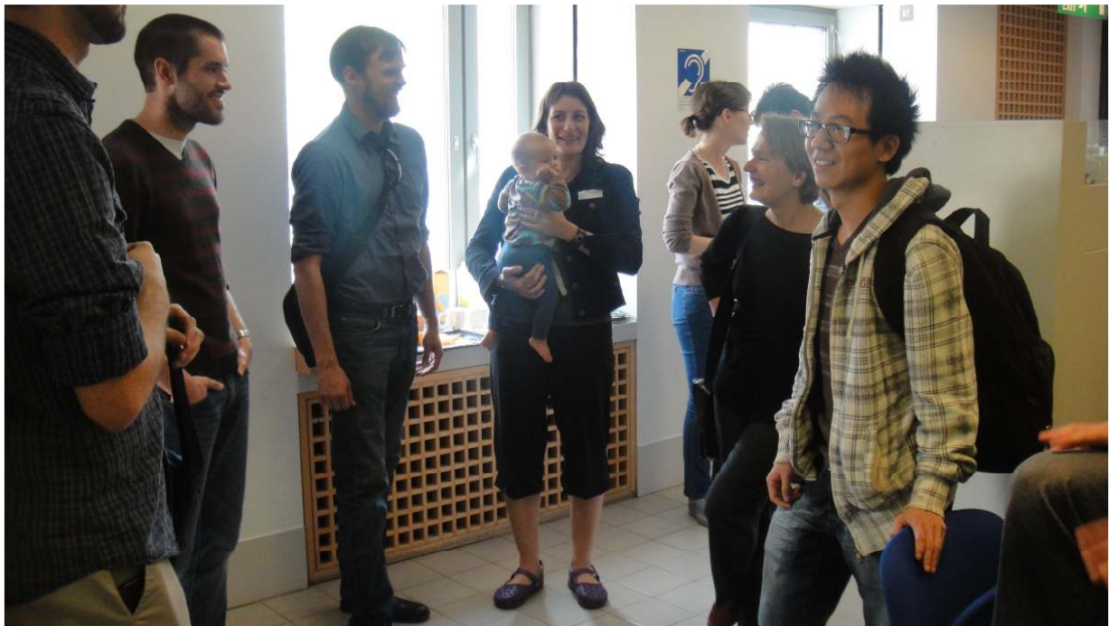
Norwich, England (June 2014, O. at 7 months)