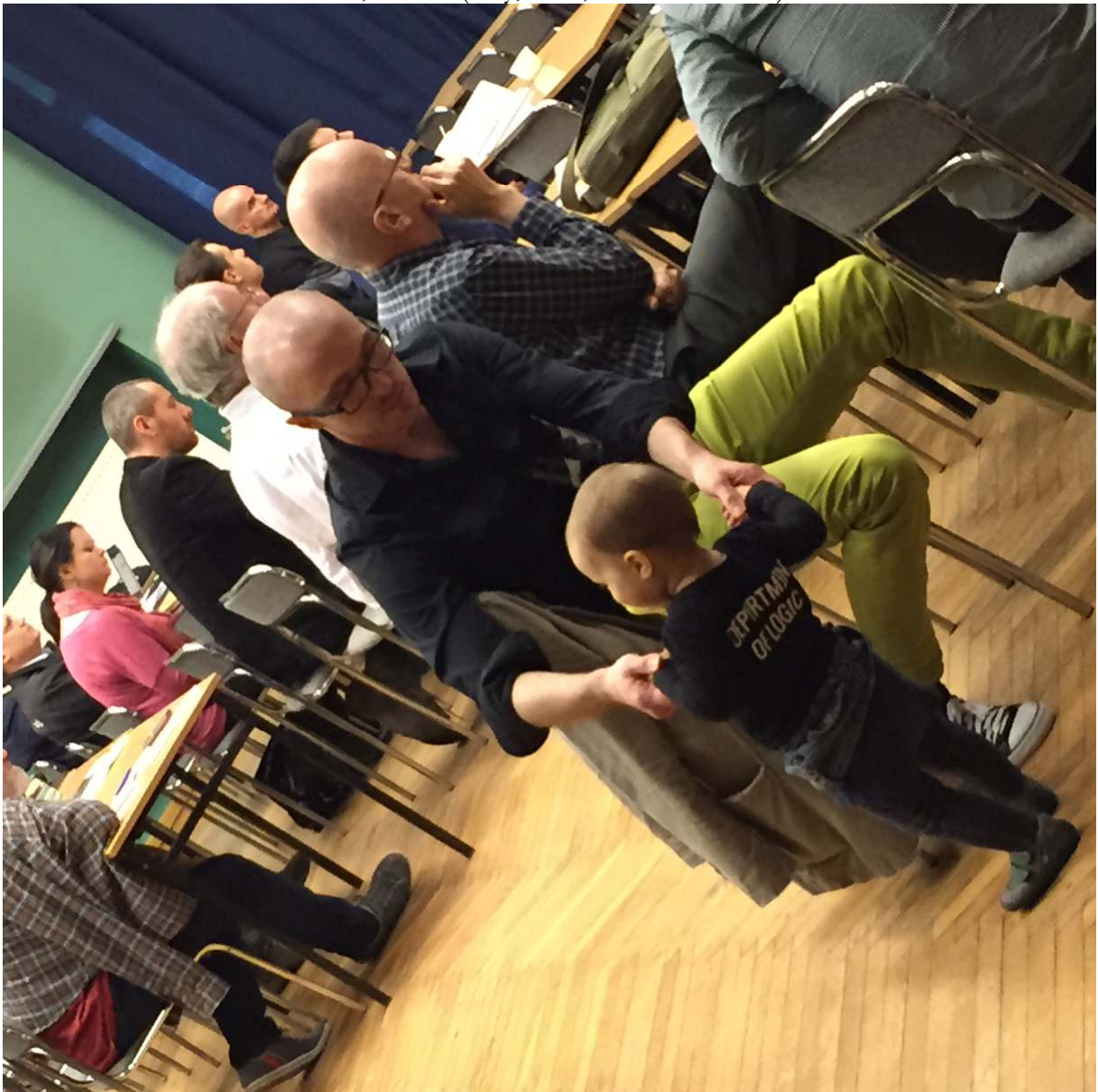
Łódź, Poland (May, 2015, O. at 18 months)