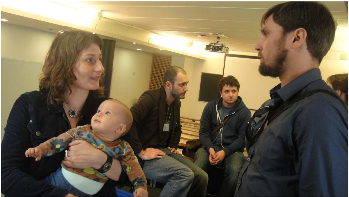
Norwich, England (June 2014, O. at 7 months)